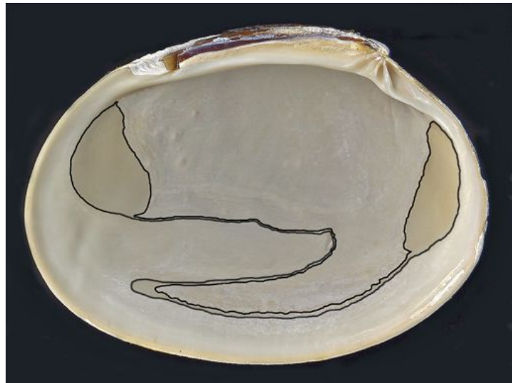
Callithaca tenerrima (Carpenter, 1857)