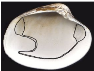
Venerupis philippinarum (A. Adams & Reeve, 1850)