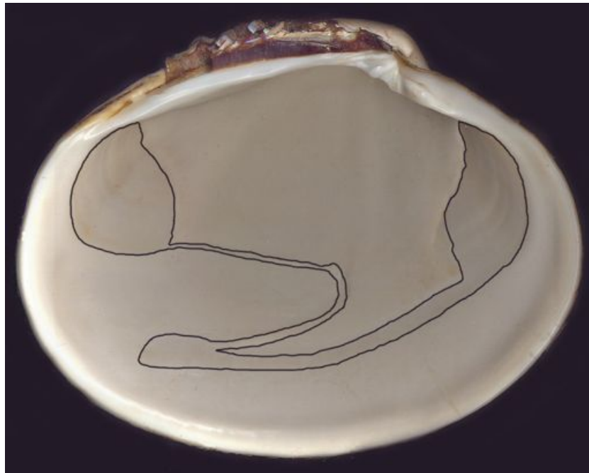
Saxidomus gigantea (Deshayes, 1839)

The images are of specimens from the author's collection and were created using a flat deck scanner. The scale is the same for all the images.