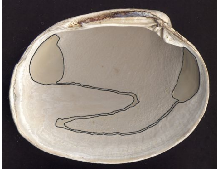
Paphia restorationensis Frizzell, 1930

The posterior and anterior muscle scars and the pallial line that joins them have been highlighted so as to better show the pallial sinus. These species all possess long siphons and the place where the anchoring line infolds or invaginates is where the pallial sinus is located. Siphon lengths within species differ and the place of the pallial sinus is an important indicator in determining what a species might be.