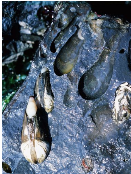
Penitella penita in situ. Note flask shaped burrows.

Along our west coasts, the most frequently encountered piddock species is Penitella penita (the Flap-tipped Piddock) which burrows into sedimentary rock, particularly sandstone. The much larger Zirfaea pilsbryi (the Rough or Pilsbry's Piddock) with a shell length to 15+ cm or 6+ inches) prefers blue clay. Here it can penetrate 40 cm (16") or more.